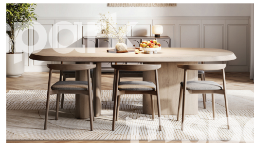
Item #17 Add additional descriptions or info here.