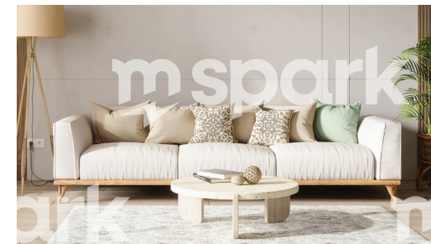
Item #27 $000 Add additional descriptions or info here.