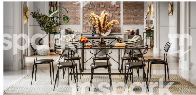
Item #12 $000 Add additional descriptions or info here.