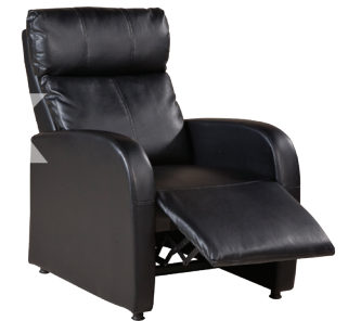
Item #25 Add additional descriptions or info here.