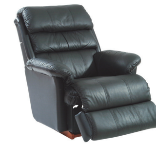
Item #23 Add additional descriptions or info here.