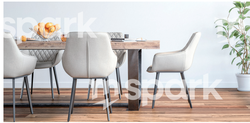
Item #9 $000 Add additional descriptions or info here.