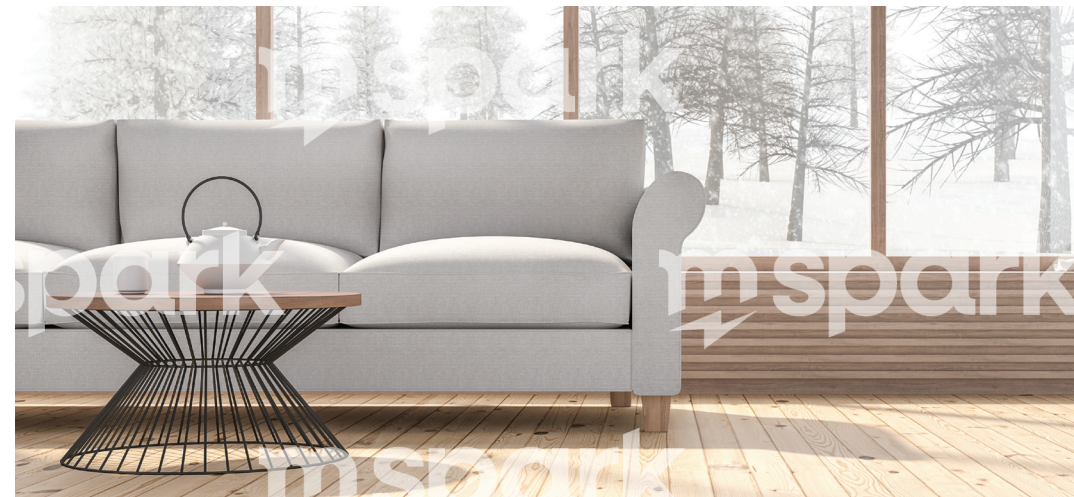
Item #14 $000 Add additional descriptions or info here.