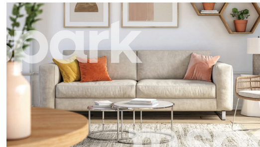
Item #15 Add additional descriptions or info here.