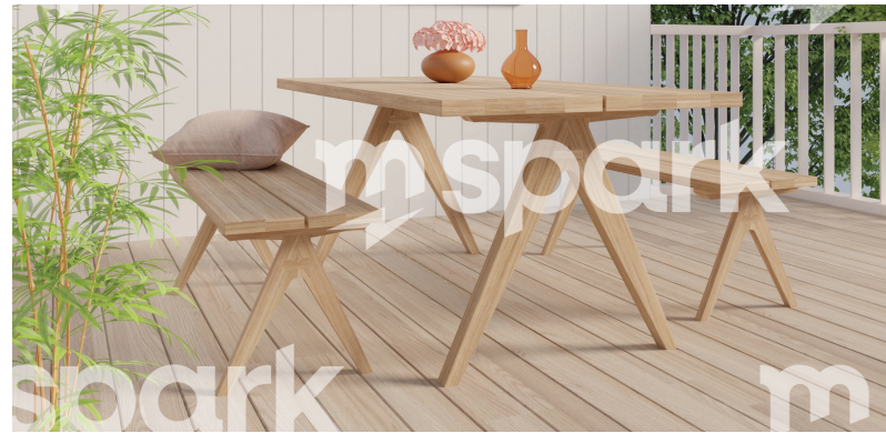
Item #10 $000 Add additional descriptions or info here.