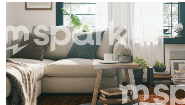
Item #26 $000 Add additional descriptions or info here.