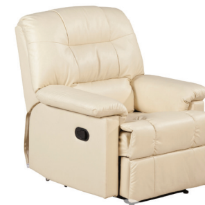
Item #21 Add additional descriptions or info here.