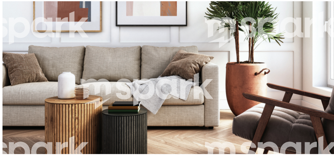
Item #13 $000 Add additional descriptions or info here.