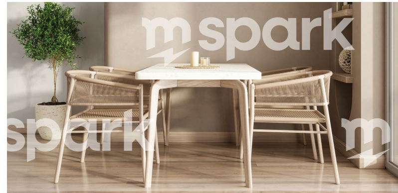
Item #11 $000 Add additional descriptions or info here.