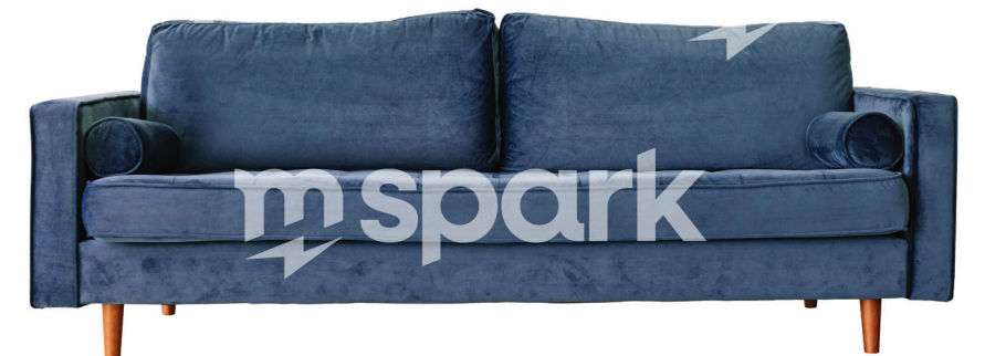
Item #20 $000 Add additional descriptions or info here.