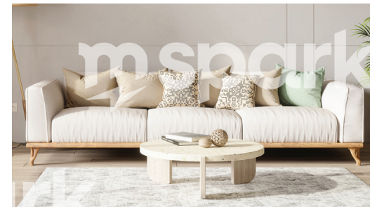
Item #16 Add additional descriptions or info here.