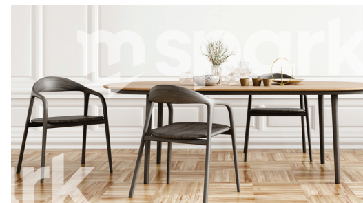
Item #18 $000 Add additional descriptions or info here.