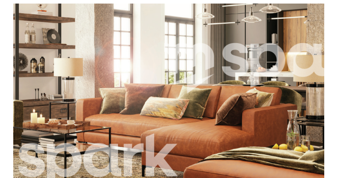
Item #28 $000 Add additional descriptions or info here.