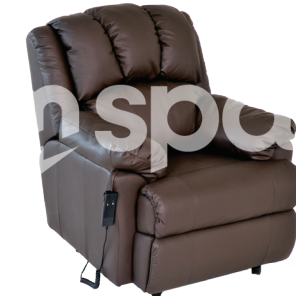
Item #22 Add additional descriptions or info here.