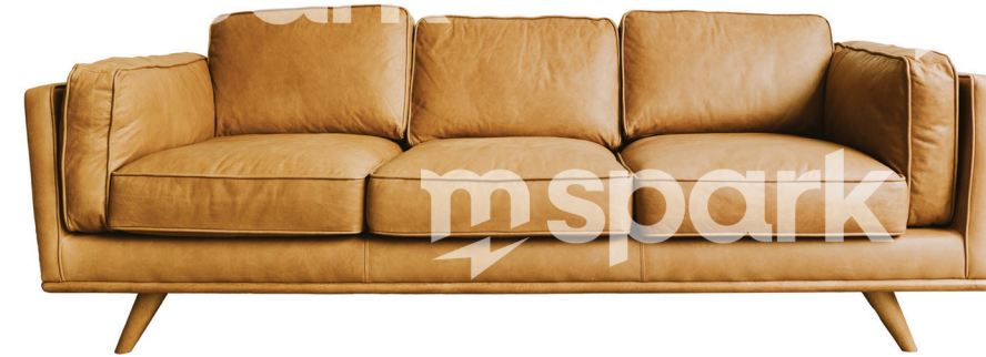
Item #19 $000 Add additional descriptions or info here.