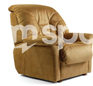
Item #24 Add additional descriptions or info here.